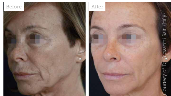
Patient before and six months after full face rejuvenation with the Aliaxin range