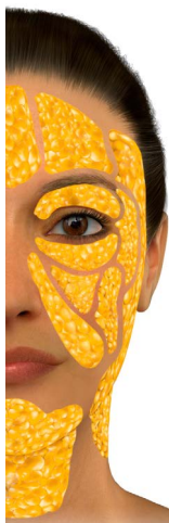
Figure 3: Fat compartments.