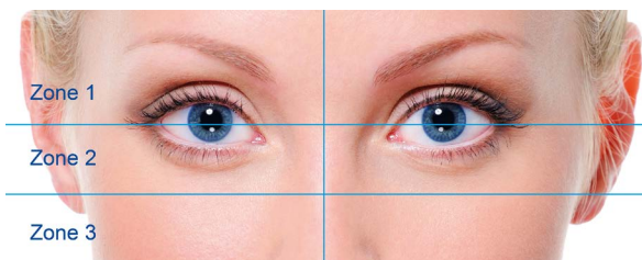
Figure 1: Zones of periorbital area.

The lower edge of the periorbital area forms the upper portion of