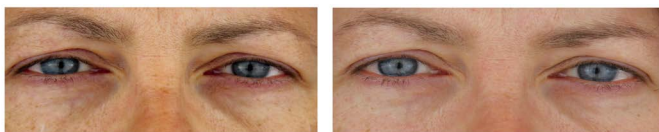
Figure 7: Results.