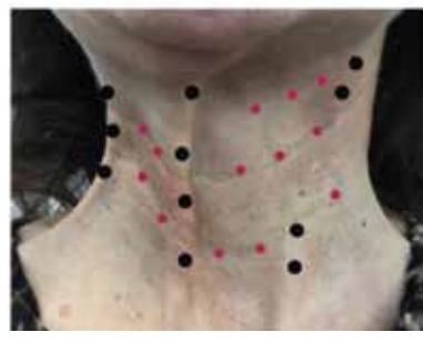
Figure 2: Botulinum toxin technique.